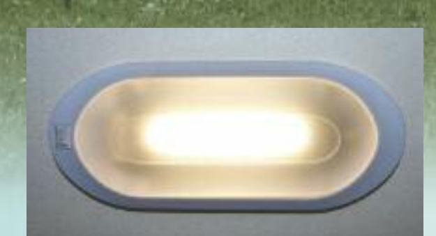
LED INTERIOR LIGHTING ▲ Energy efficient