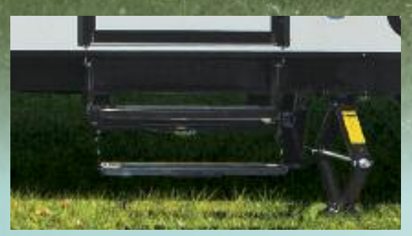
DOUBLE ENTRY STEP Convenient, easy entry