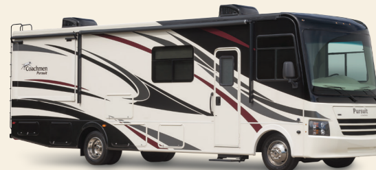
Partial Paint with Vinyl Graphics (Optional)