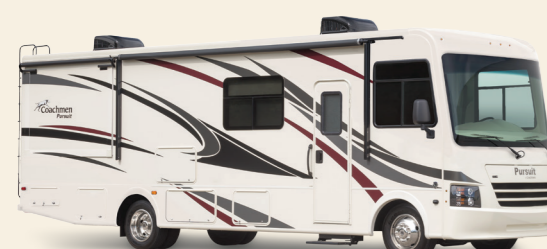
Vinyl Graphics (Standard)