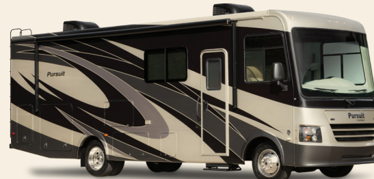
Full-Body Paint – Sand Castle (Optional)

New exterior graphics, including redesigned partial paint and full-body paint options, will make you stand out on the road.