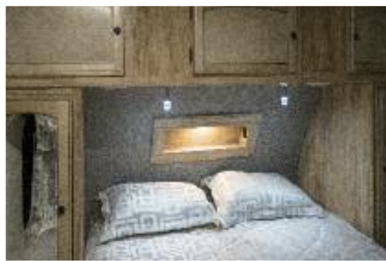
All Freedom Express Travel Trailers have 60" x 80" Queen Beds.