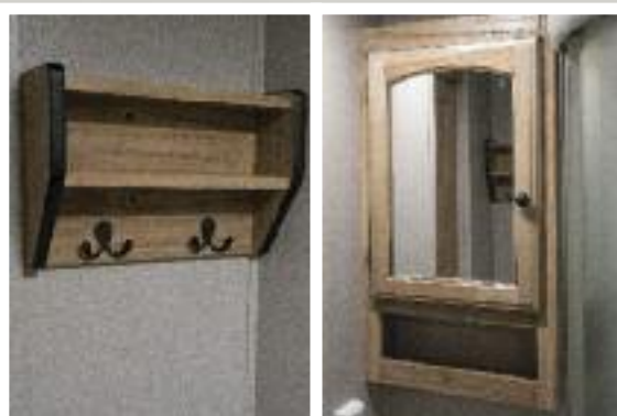
Custom-made Medicine Cabinet with added Shelf and Deluxe Robe Holder.