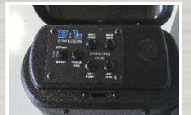
5-point stabilizing Power Tongue Jack system, standard on Liberty and Maple Leaf Editions.