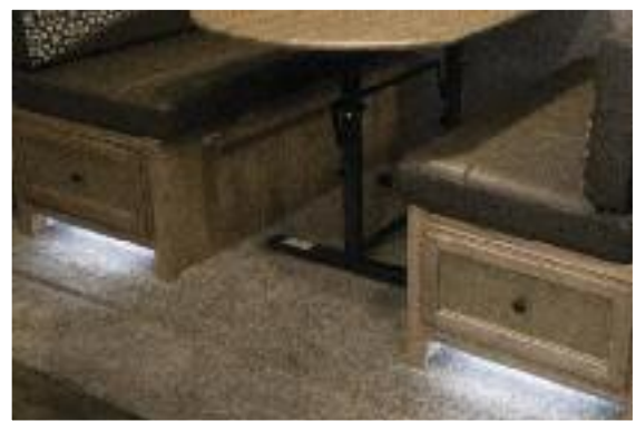
Elegant LED Accent Lighting throughout.