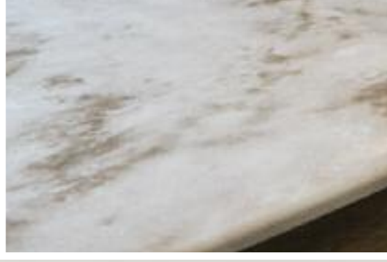
Seamless Edge Countertops are standard on Freedom Express. Solid surface countertops are standard on Liberty.