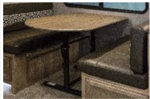
Foldable Dinette Table can be used indoors or outdoors and converts to a sleeping area.