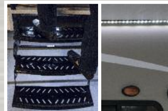
The LED Step Light, Awning Light and Scare Light will keep you safe and secure.