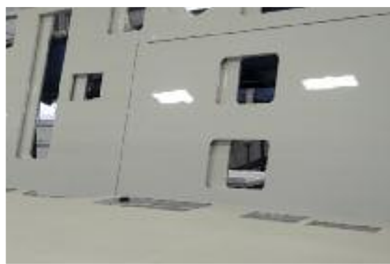
Vacuum Bonded Walls with Azdel.