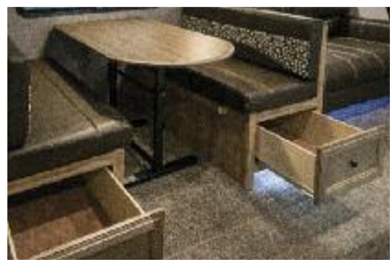
Full-size Pull-out Drawers for easy access dinette storage on all Liberty models.