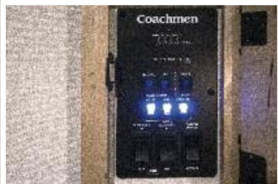
Centralized Control Panel indicates tanks, battery levels and operating components.