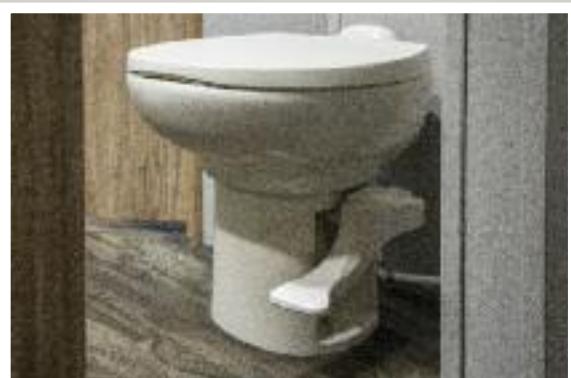
Porcelain Foot Flush Toilet is easy to clean.