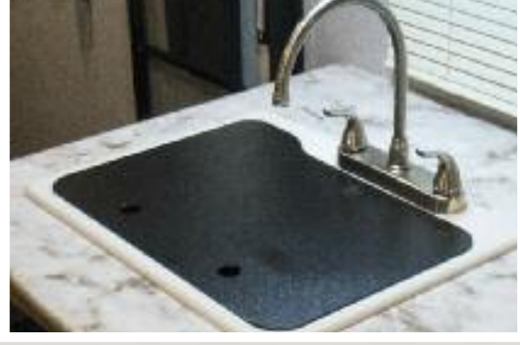
Sink Cover adds counter space - standard in both Liberty and Ultra Lite.