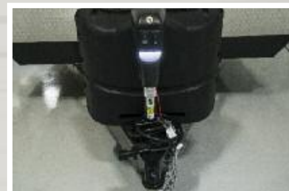
The Power Tongue Jack is the safe, easy way to raise and lower your hitch, optional on Ultra Lites.