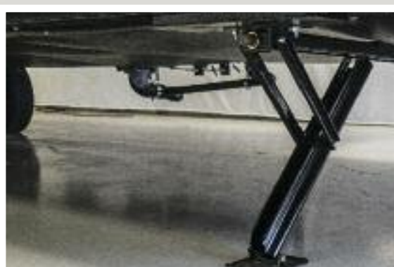
Power Stabilizers extend and retract in record time.