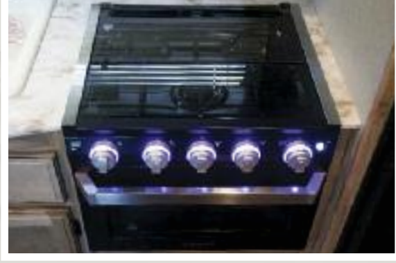
NEW Furrion Stove and Cooktop with integrated flush mount glass cover adds style and is easy to use