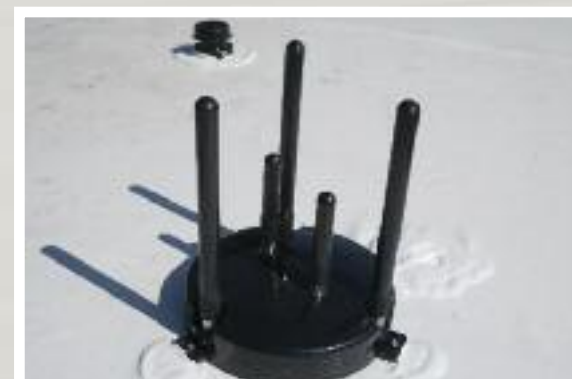
Stay connected with the all new Wifi Extender and 4G LTE Antenna.