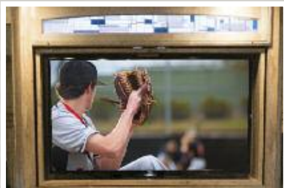
40" LED HD Televisions.