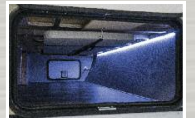
Fully Lighted Pass-thru Storage with a 24" x 48" outdoor resin table stored above.