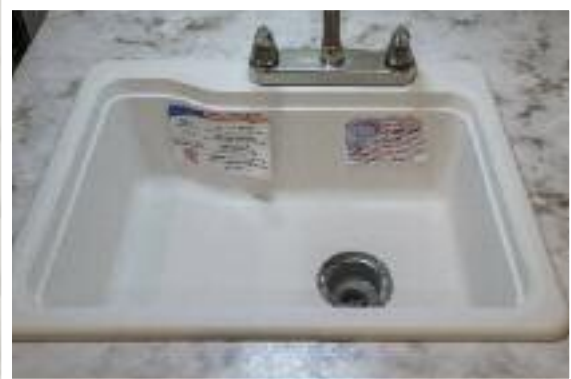
This Stone Cast Sink fits large pots and pans. Made in the U.S.A. with a lifetime guarantee.