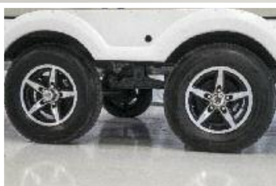
Stable Ryde Spread Axles provide better weight distribution, handling and improved towing.

Features and Options listed above may not be available on all models.