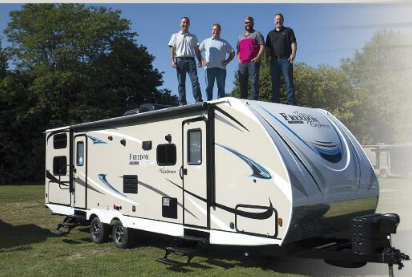
Freedom Express' Fully Walkable Roof makes trailer maintenance and inspections safe and easy.

Features and Options listed above may not be available on all models.