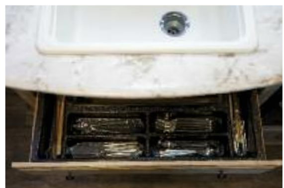
Exclusive Utensil Drawer for convenient storage of camping's basic necessities.