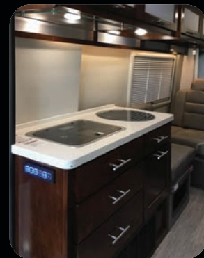
High Gloss Cherry cabinetry