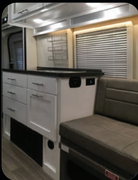
High Gloss White cabinetry

This versatile Class B motorhome is designed for today's active lifestyles. Experience unrivaled fuel economy combined with legendary Ford® styling and reliability. Relax in luxurious captains seats while enjoying the view through large frameless windows. The interior ergonomics ensure you are as comfortable on the road as you are at home. Beyond gets you where the action is, in style!