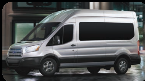
Ingot Silver exterior paint now available