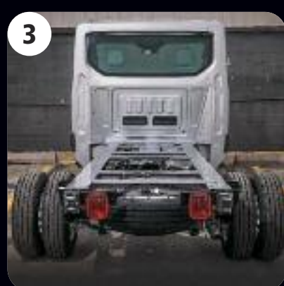
Dual Rear Wheels/ Rear Wheel Drive for Improved Handling