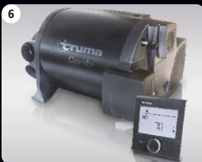
Truma Combi™, the 12V/110, Lightweight, Forced-air Furnace that provides both Heat and Warm water