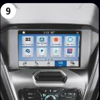
Sync 3 Voice Activation Fully Integrated Entertainment and Communication System