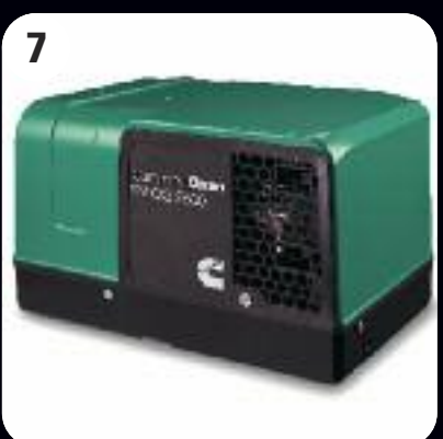
Onan Micro Lite 2800kw Gas Generator