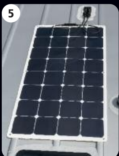
Go Power! 100W Solar Panel with Independent Smart Charging of Coach Batteries