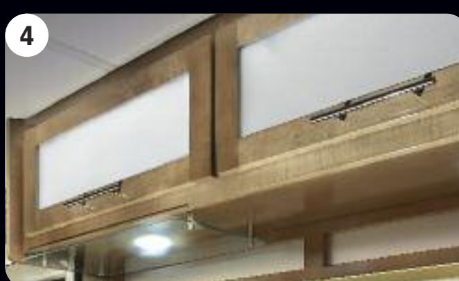
Custom Solid Hardwood Cabinetry - No Wrapped Stiles or Vinyl Wrapped MDF Doors!