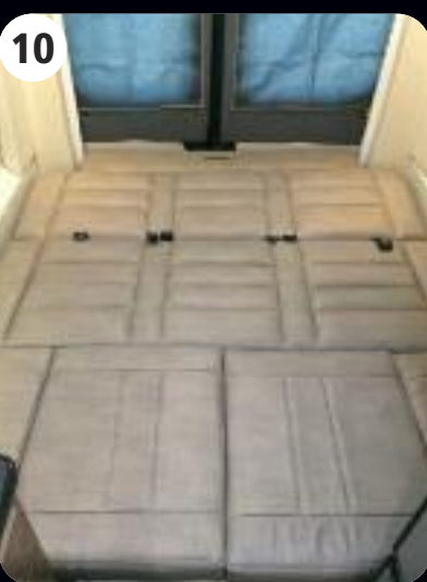
Largest Sleeping Area of ANY GAS CLASS B! 68"W x 76"L