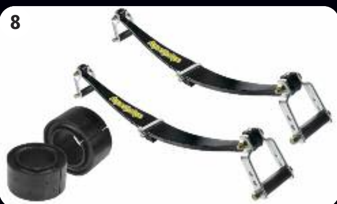
Sumo Spring Front and Rear Suspension for increased driving comfort and performance