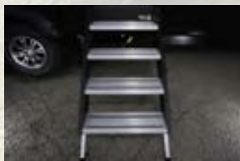
4-STEP (SOLID STEP®) ENTRY