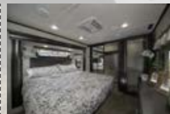
KING & QUEEN SUITES AVAILABLE.