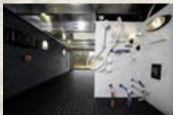
MASSIVE DROP FRAME STORAGE