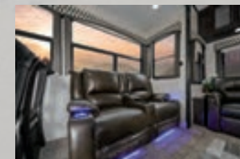
THOMAS PAYNE® SEATING