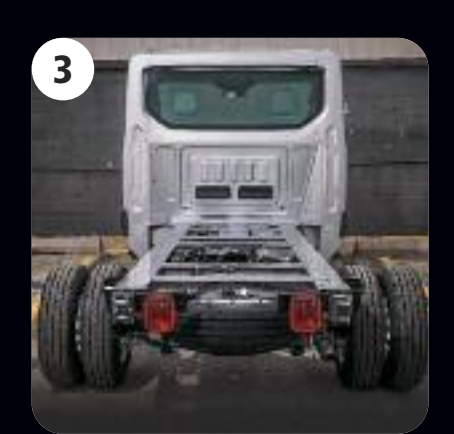
Dual Rear Wheels/ Rear Wheel Drive for Improved Handling