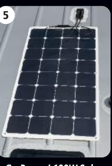
Go Power! 100W Solar Panel with Independent Smart Charging of Coach Batteries