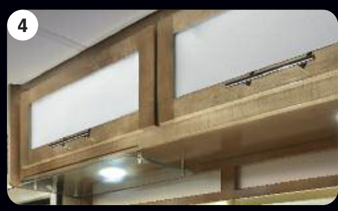
Custom Solid Hardwood Cabinetry -No Wrapped Stiles or Vinyl Wrapped MDF Doors!