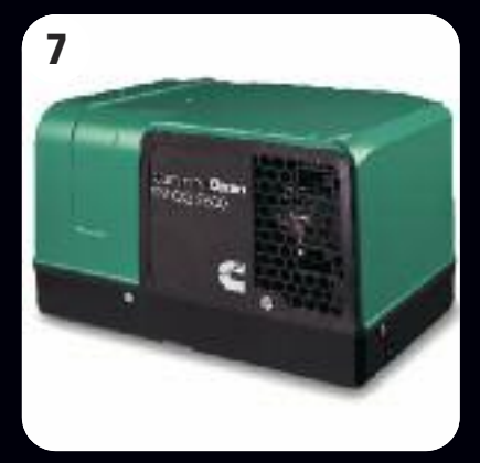
Onan Micro Lite 2800kw Gas Generator