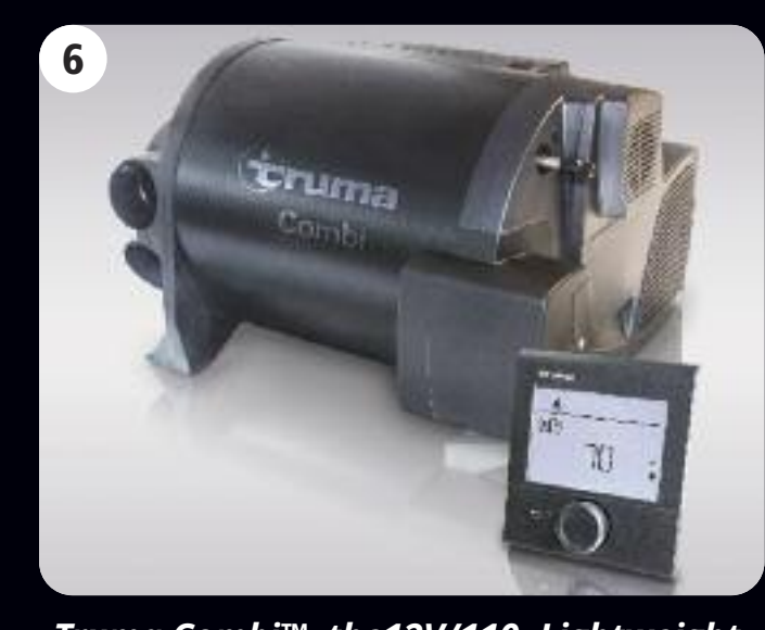
Truma Combi™, the12V/110, Lightweight, Forced-air Furnace that provides both Heat and Warm water