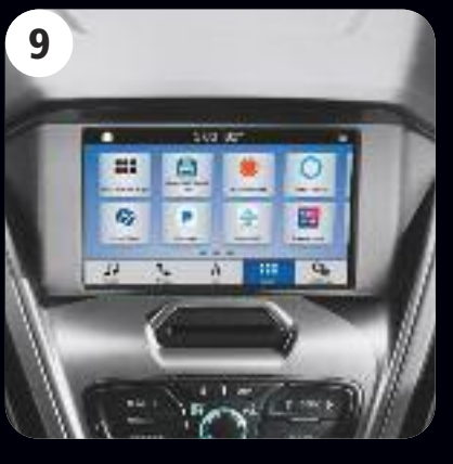
Sync 3 Voice Activation Fully Integrated Entertainment and Communication System