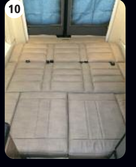
Largest Sleeping Area of ANY GAS CLASS B! 68"W x 76"L