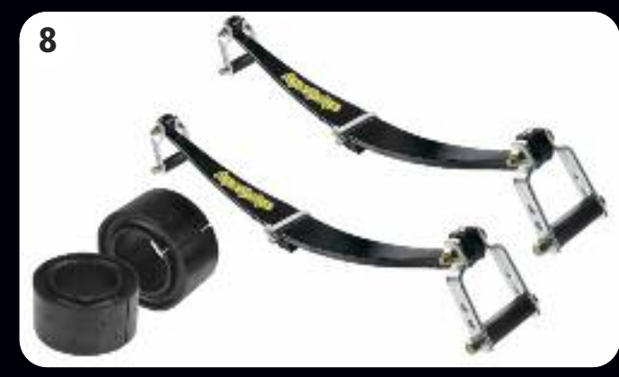
Sumo Spring Front and Rear Suspension for increased driving comfort and performance