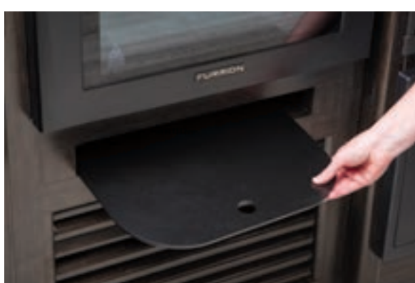
Sink Cover Storage