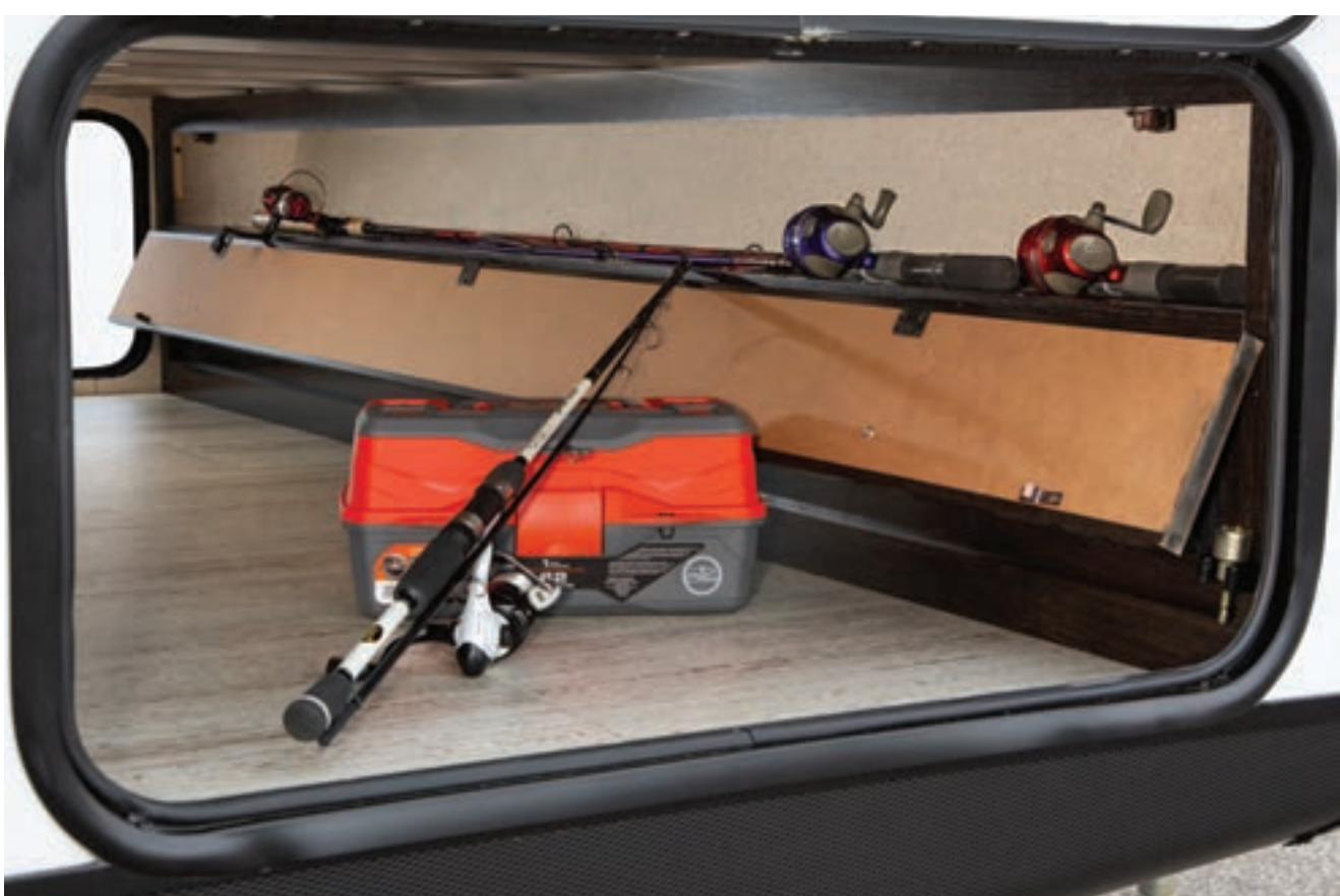
Pass-through Fishing Rod Storage