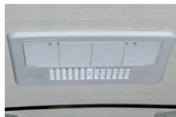
"Twice Cool" Dual Air Conditioning Duct System