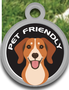
Exterior Dog Leash Clip • Pet Center • Exterior Dog Wash