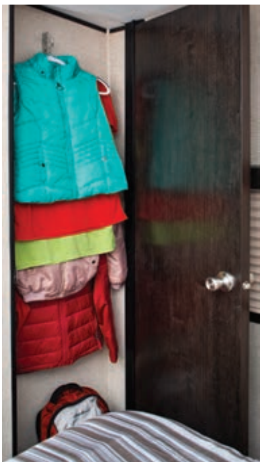
Hanger Closet (N/A all models)