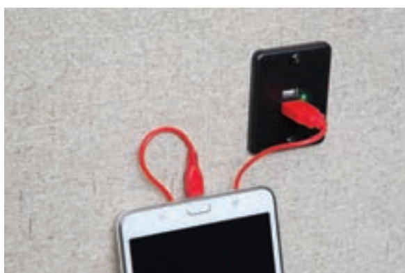
Lighted USB Ports