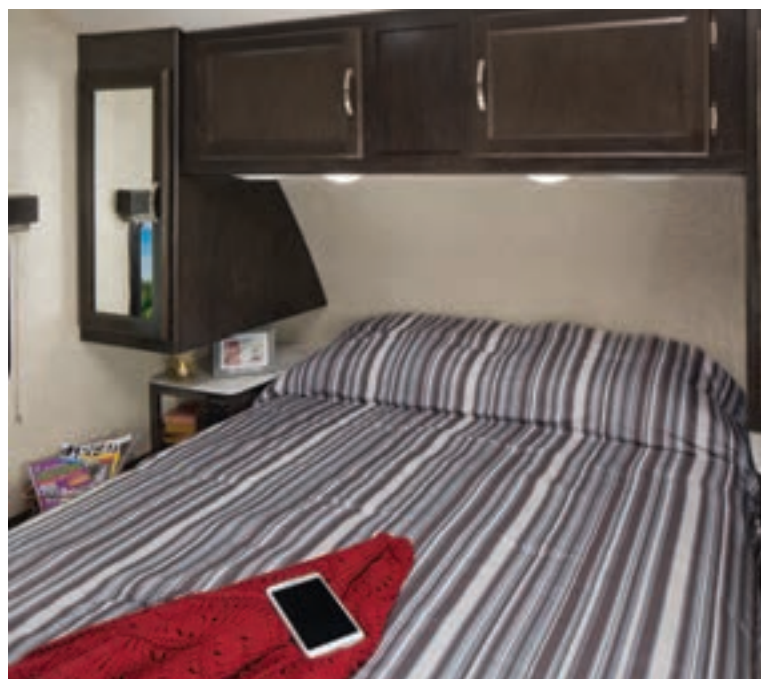
60" x 80" Bed