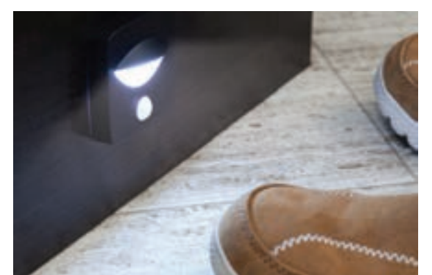
Motion Activated Floor Lights