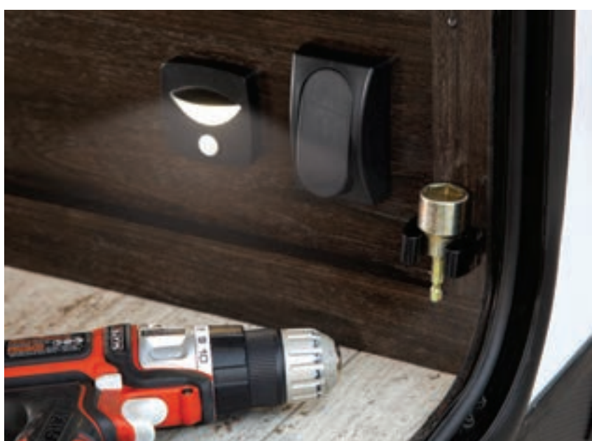
"Easy Up" Quick Connect Stabilizer Jack Bit, with Handy Motion Activated Light