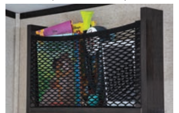
Kids Convenience Center